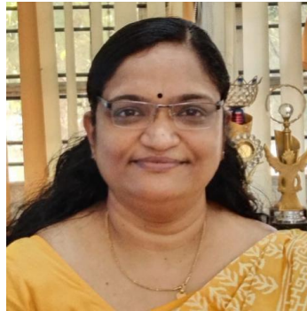
Patron & Director, SLS, CUSAT