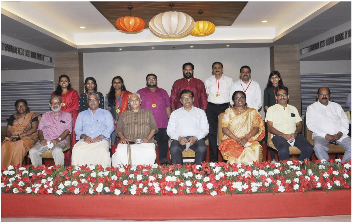
Annual Alumni Meet and Gold Medal Distribution, 2021