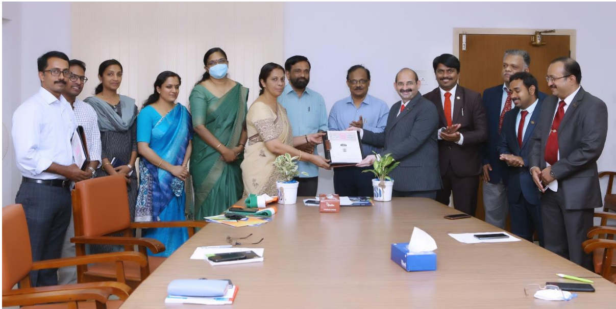
MOU signed with Institute of Company Secretaries of India